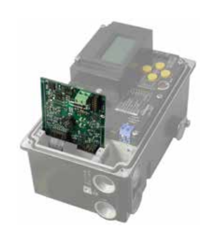
Auxiliary Card Being Installed

Limit switches: A variety of Logix MD+ limit switch kits are available to provide you with an independent verification of the position of the feedback shaft.