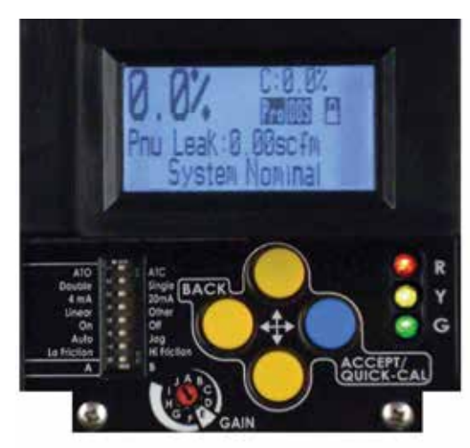
The Logix 520MD+ User Interface

*Typical calibration time for actuators 25 square inches or smaller is less than 45 seconds. Calibration time depends on total stroke time.